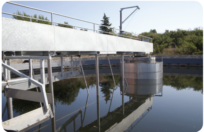
Wastewater treatment plant holding tank.